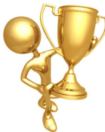
The Young Scientist Award & The Best Poster Award

will be awarded to outstanding young scientists, who are at the beginning of their career and who conduct basic or applied research in the field of microbiota and disease.